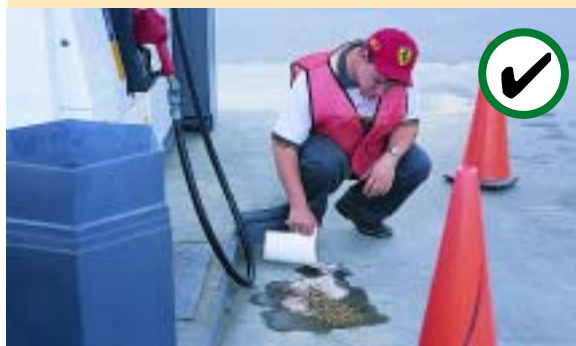
Shell staff are trained in the proper spill cleanup procedures.

shut itself off. Ease up at the halfway point, and never fill the container more than 95% full to allow for expansion.