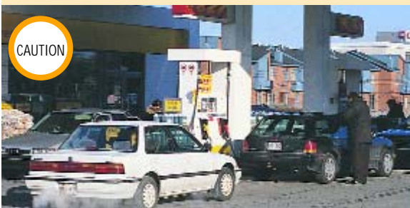
Drive slowly around the pumps - this can be a very busy area.

any fumes. But more importantly, cell phones pose a distraction from the important business of refueling.