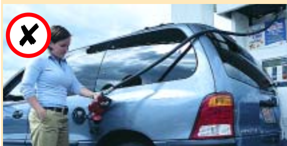
Do not fill your tank from the wrong side.