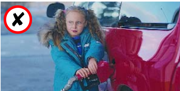
Children should not play around, or operate, the pumps.