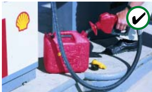
Always fill CSA- or ULC-approved containers on the ground.