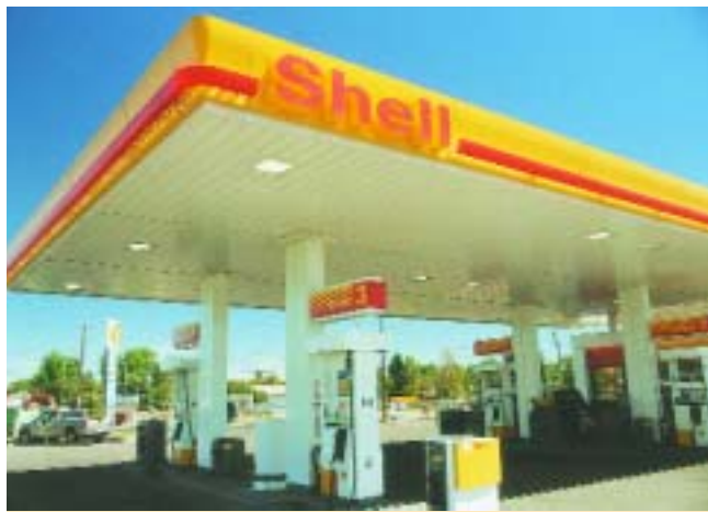
Safety rules are essential when you're close to the pumps.

Shell provides safety training for its Retailers and Sales Associates, and our sites are designed with safety in mind. Our safety procedures are verified