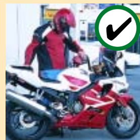
Always dismount from your motorcycle when refueling.