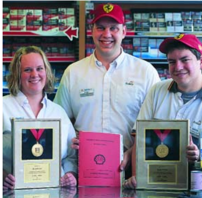
Shell is proud of the excellent safety record achieved by its site staff.

We believe that our excellent safety record is main-