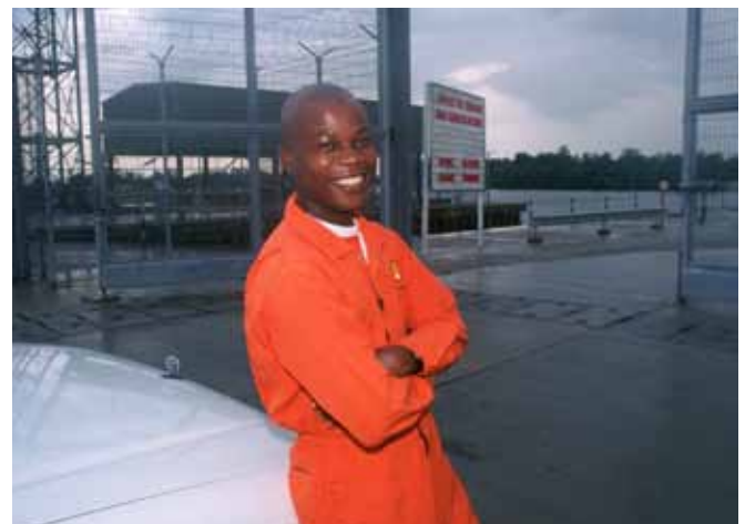
An employee at Soku gas plant

Shell has been the pioneer oil and gas industry player in Nigeria. In the period since its establishment, SNG has excelled as a local company that maintains global standards. It is the first and currently the only local gas distribution